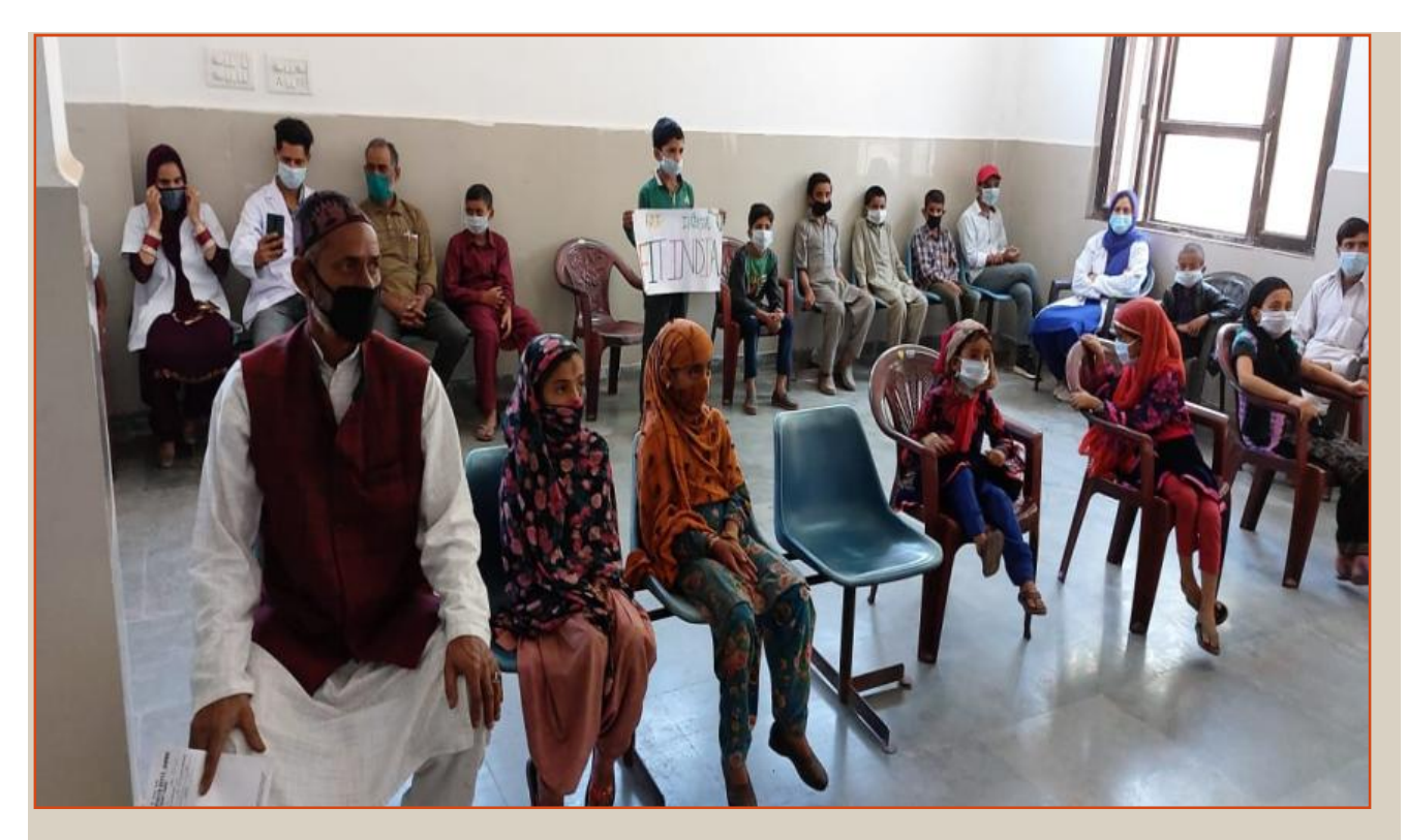
Awareness regarding leprosy in urban slums and AWC of Jammu district of Jammu division by ASHAs.

District Ramban and Reasi of Jammu division, , leprosy awareness talk conducted in the OPD of maternal and Child Health department of District Hospital.