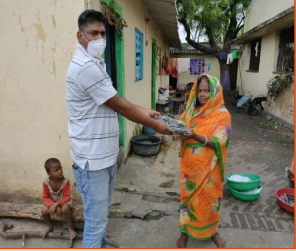
Various NLEP activities along with Signature Campaign, MCR, selfcare kits and Certificates distribution done in East Singhbhum district.