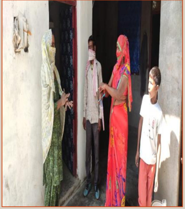
Distribution of MCR foot wear at CHC Hathin, Haryana