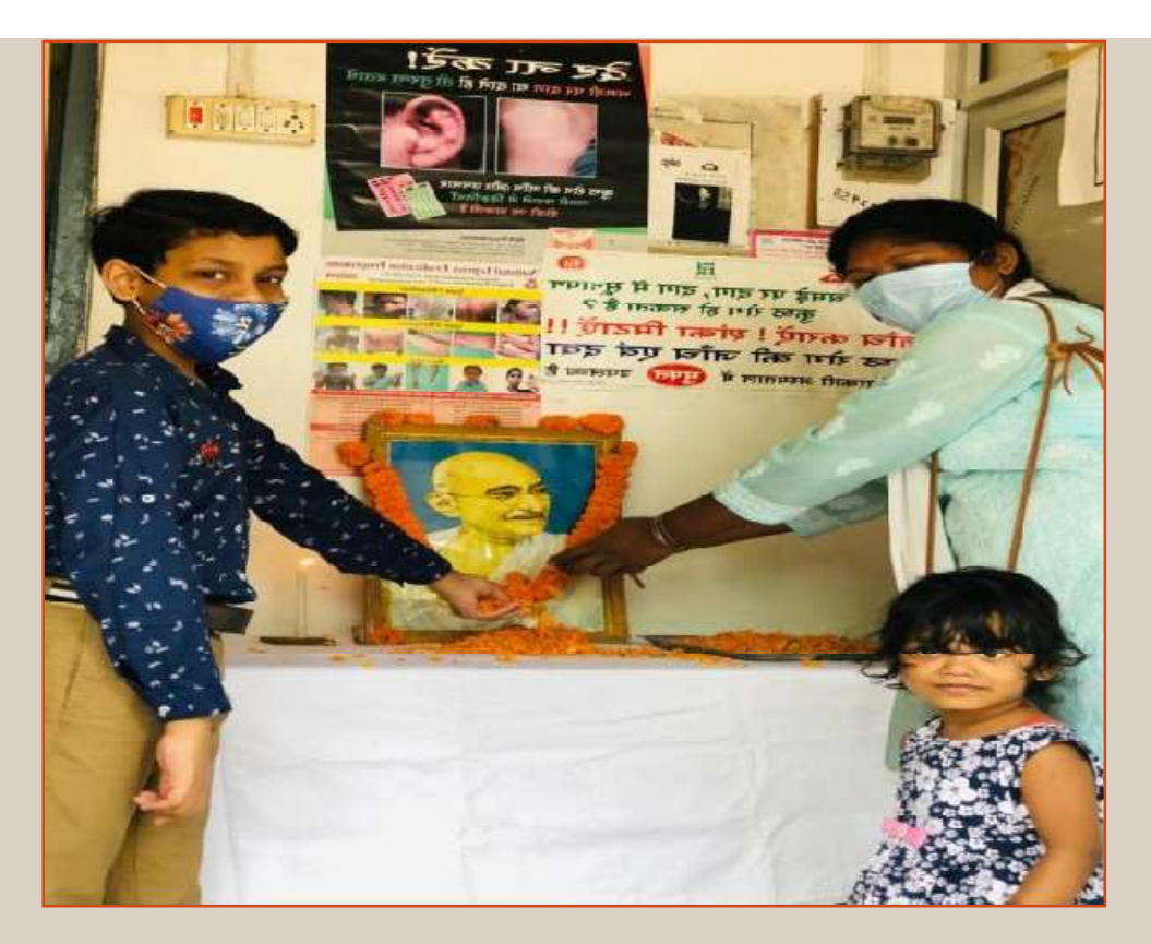
Self-care KIT distribution and oath taking activity at various health facilities Jharkhand