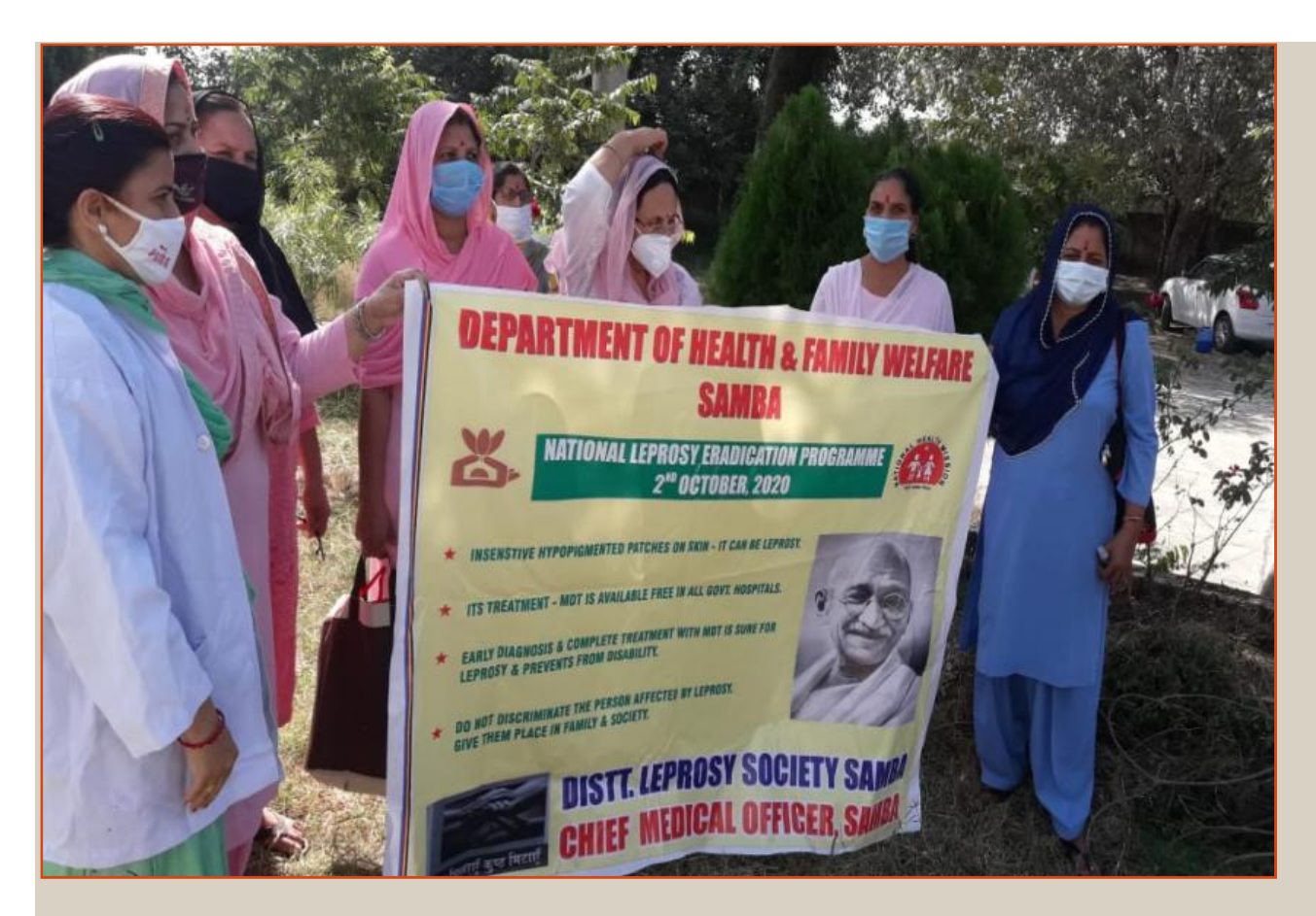
Kusht Mukti Abhiyan celebration across District Samba, Jammu