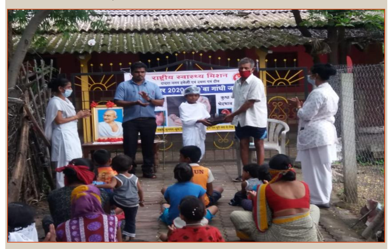
Awareness meetings regarding leprosy conducted at the community as well as health Facility level.