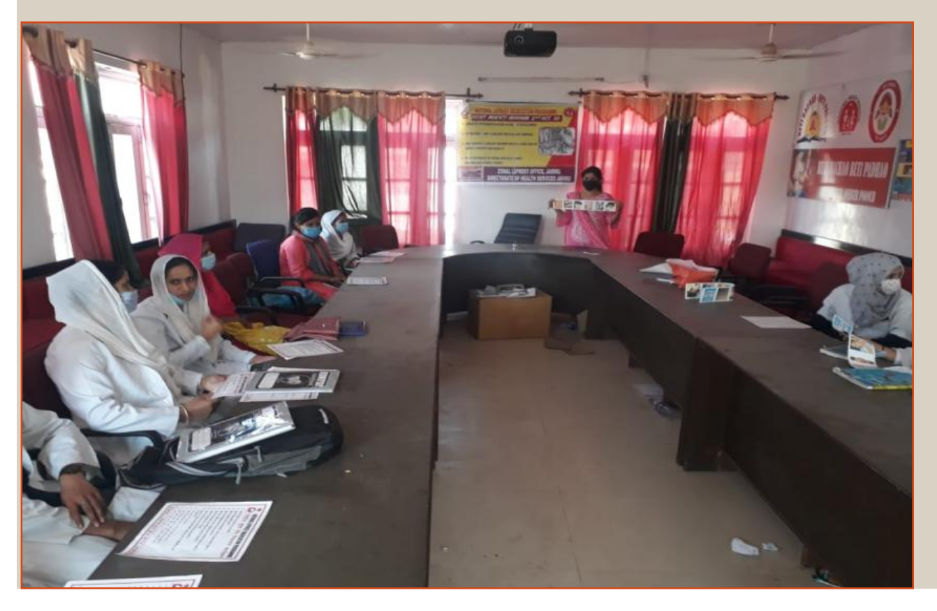
District Poonch of Jammu division, leprosy awareness talk conducted in the OPD of District Hospital.

Leprosy awareness activity organized at Kathua district of Jammu division, wherein students of nursing college were involved.